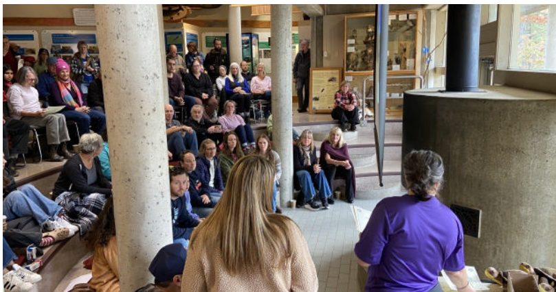
Celebration at the Park Office on November 8