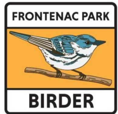
Birder Challenge badge

Sign up on our website, friendsoffrontenac.com