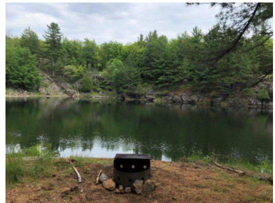
The view from campsite 16

This single site is located on Clearwater Lake. The shoreline is deep and rocky but still good for swimming. You can expect the hike to be 4 hours from the Big Salmon Lake parking lot, or less than a 1 hour hike from the Kingsford Dam parking lot. You can also canoe to this site in about 3 -3.5 hours from Kingsford Dam boat launch or from the Canoe Lake road bridge. There is a 1003m portage required from Birch Lake. Site has poor drainage and can be wet in the spring. Motor boats are not allowed on Clearwater Lake. In season you can fish for brook trout.