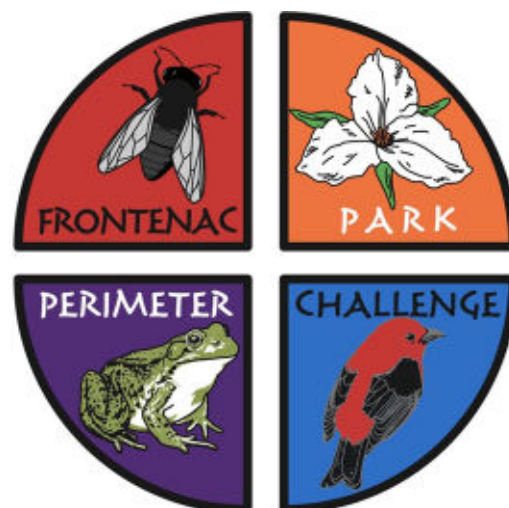
Perimeter Challenge Badge