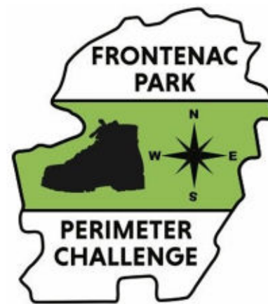
Perimeter Challenge Logo